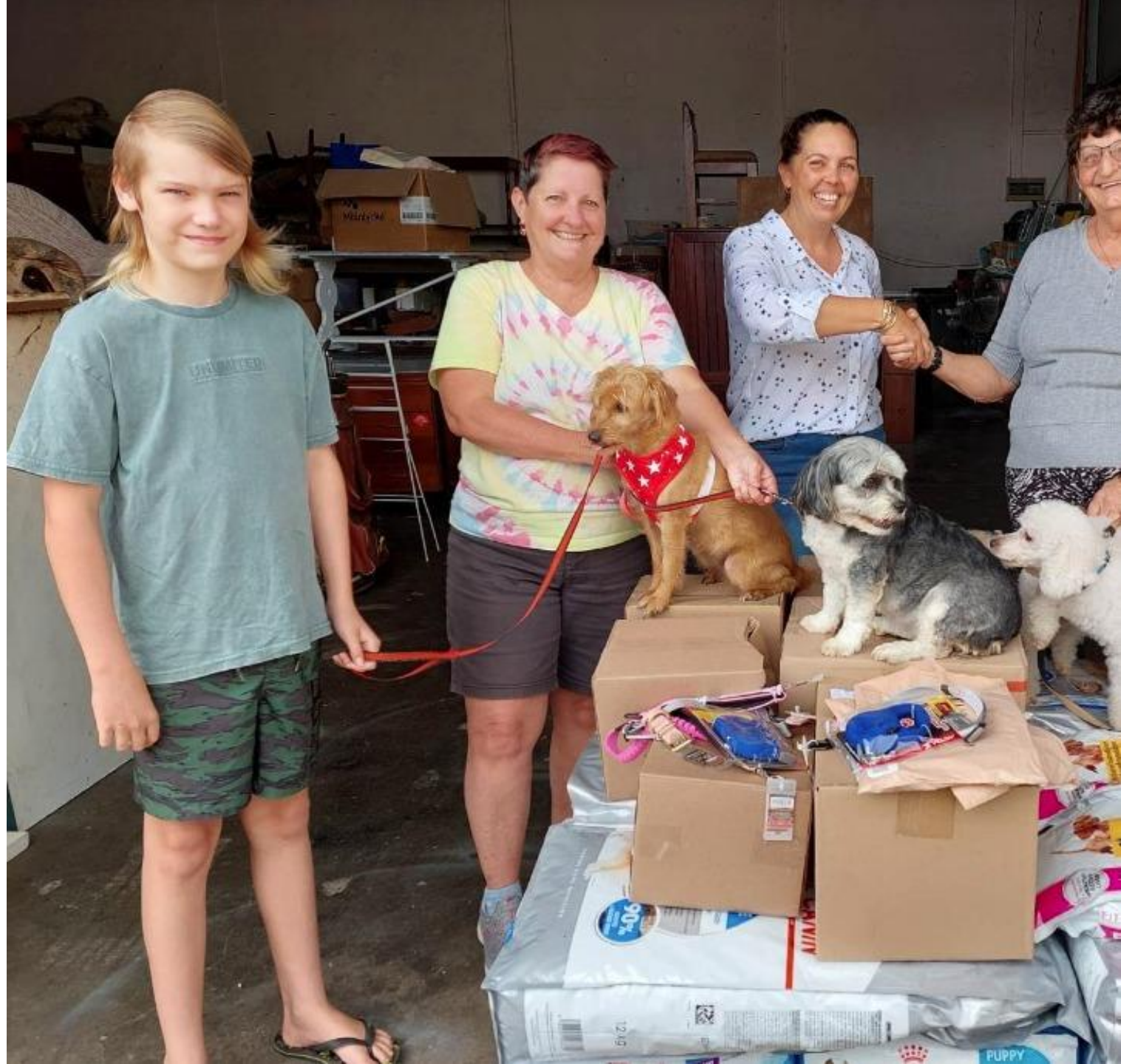
Photo: Food support for pets with Better Together Community Support, Atherton